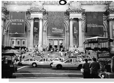
THE METROPOLITAN MUSEUM OF ART "The Met"

A gigantic New York City museum with art from all over the world and from all time periods.